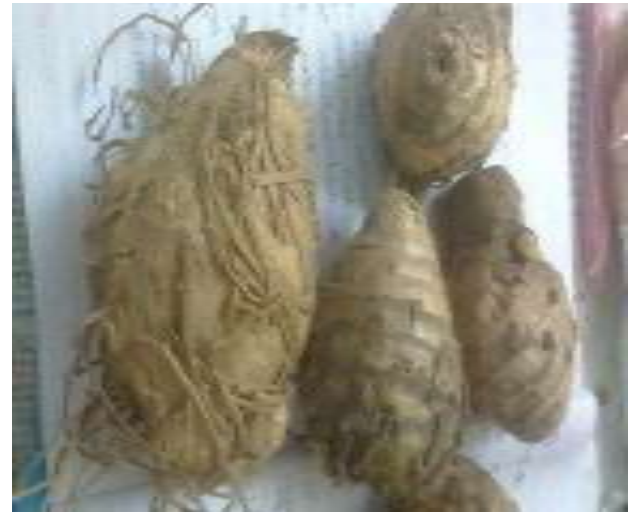
Figure:1. fresh rhizomes of Curcuma aromatica Salisb.

Touch-Slightly rough external surface with big round scar, hard & heavy.