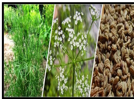
Fig.4: Trachyspermum ammi Linn.