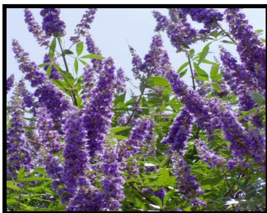
Fig.1: Vitex agnus castus

6. Karafs/ Celery ( Apium graveolens Linn.) Fig.6: Methanolic extract of apium graveolens has effective role in obesity induced infertility as it has shown anti-obesity, 55 hypoglycemic, 56 hepatoprotective, anti-oxidant properties due to presence of flavonoids, glycosides phenolic constituents such as apigenin & luteolin. 57,58