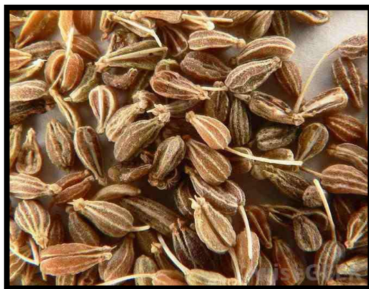
Fig.5: Pimpinella anisum Linn.