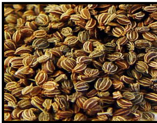
Fig.6: Apium graveolens Linn.

Conclusion: Infertility affects approximately one in six couples during their lifetime. Obesity has become an epidemic because of sedentary lifestyle and dietary changes. Obese women are three times more likely to suffer from infertility than the women with normal body mass index and may take longer time to conceive. Pharmacological treatment of obesity is associated with rebound weight gain, side effects of medication and the potential for drug abuse. Available treatment in conventional medicine for obese infertile women are associated with complications such as ovarian hyper stimulation syndrome, reduces ovarian reserve and pelvic adhesions. Effective management is available in Unani system of medicine without such side effects. Despite of several Unani drugs mentioned, clinical trial has been conducted on few medicines with inadequate randomization, small sample size, inappropriate placebos & Wide variations in the dose&duration of treatment. There is lack of common standards and appropriate methods for evaluating Unani Medicine to ensure the safety, efficacy and quality control. This indicates the importance and necessity to develop a standard operational procedure for the standardization of drugs and formulations. Hence there is a need for systematic clinical trials to enhance global acceptance.