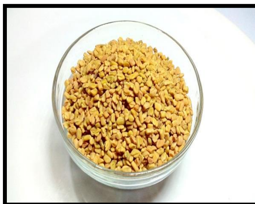
Fig.2: Trigonella foenum graecum