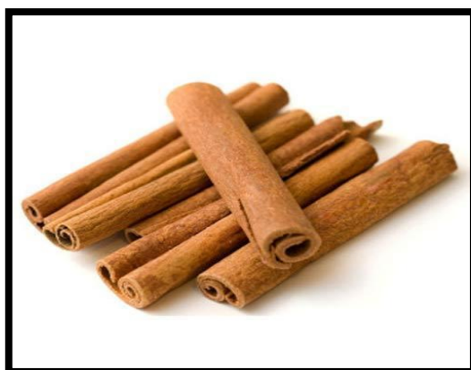
Fig.3: Cinnamomum zeylanicum