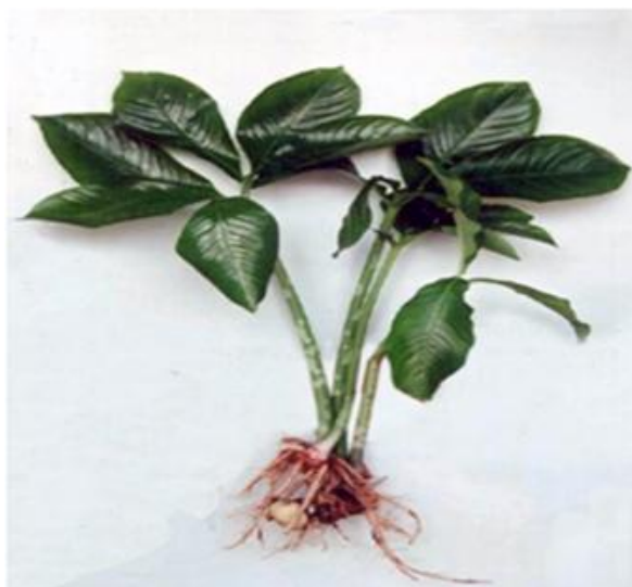
Fig:- (a) :- A. Campanulatus (Roxb.)