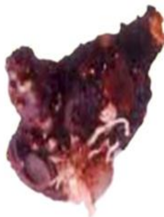
(b) :- Corm of A. Campanulatus (Roxb.)