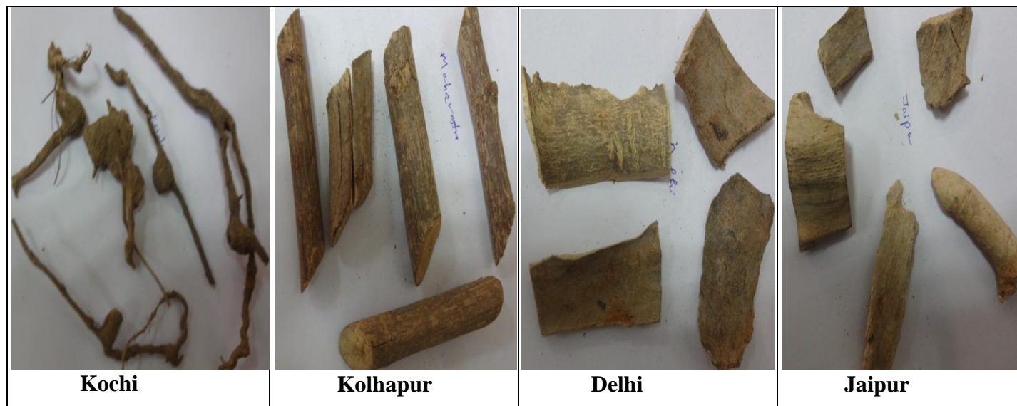
Table -1: Summarized Macroscopic Features