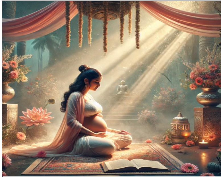
Spiritual Practices with meditation

Chanting Mantras , engaging in prayers and reading sacred texts including Gayatri Mantra support the spiritual development and instill positive values and helps in moral growth.